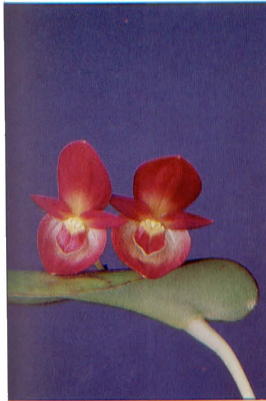
3. PLEUROTHALLIS CALOLALAX

Vegetatively, this species appears similar to many other species of section Macrophyllae-Fasciculatae with strong ramicauls longer than a horizontal, narrowly ovate leaf cordate at the base. A large, gaping, purple flower is borne successively on top of the base of the leaf. The broad, dorsal sepal and synsepal are multiveined; the petals are triangular, acute, glabrous and 3-veined; and the lip is broadly ovate and shallowly concave with the surface shiny.